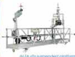
ALFA also suspended platform